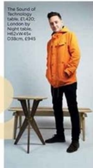
The Sound of Technology table, £1400. London by Night table, £620. H62xW45x D38cm, £945

Find out more about Gianluca's work at gianlucamingolla.com